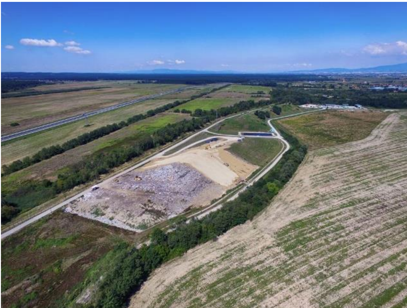
FIGURE 2. Remediated and active landfill Mraclinska Dubrava, Velika Gorica SLIKA 2. Sanirano i aktivno odlagalište Mraclinska Dubrava, Velika Gorica