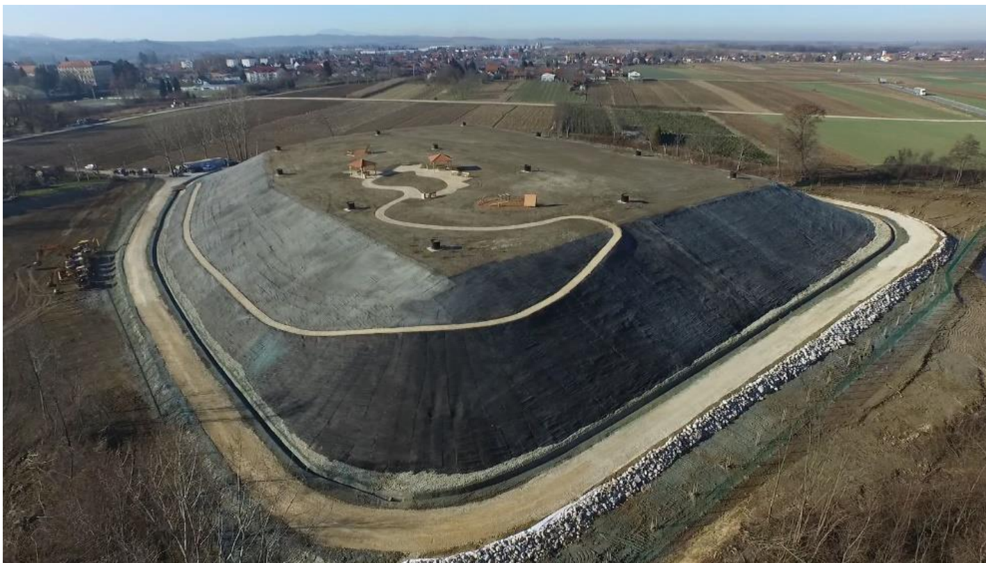
FIGURE 3. Remediated and closed landfill Meka, Ludbreg SLIKA 3. Sanirano i zatvoreno odlagalište Meka, Ludbreg